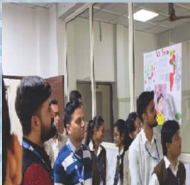
Poster Presentation on Innovative Ideas