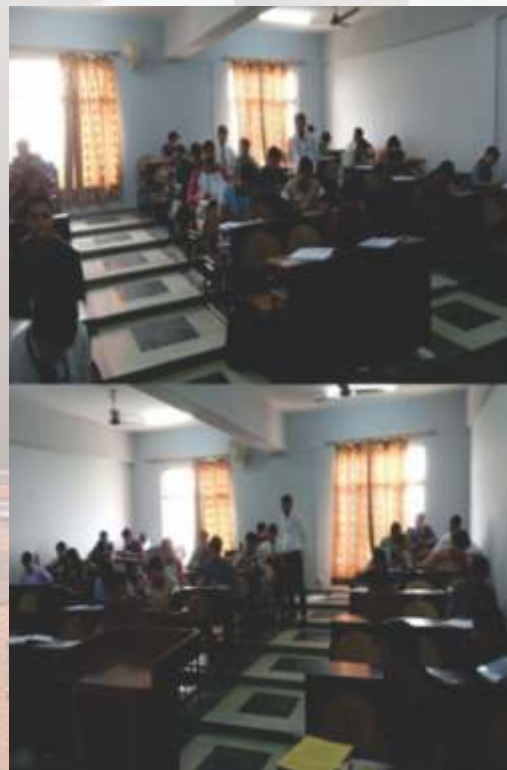
Students Participating in Online Quiz