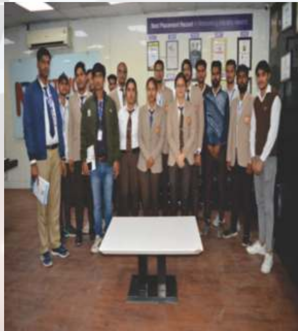
Industrial Visit to Network Bulls